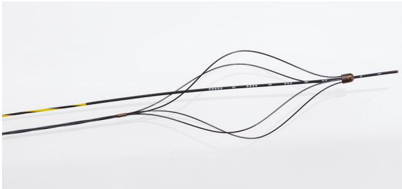
NiTi 4xDØ - KØ - Form - x